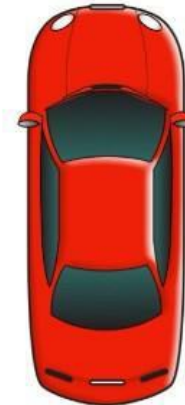
Allocated Parking Space